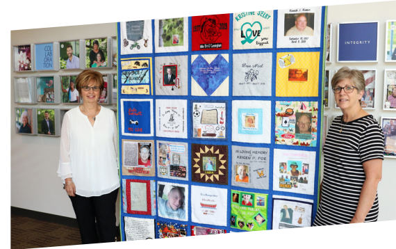
Donor Memorial Quilt

To learn more, visit https://lifelineofohio.org/donor-family-resources/